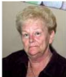
Lavada - Mar 15 East Texas.